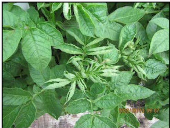
Peas, beans, lettuce, tomatoes, potatoes, peppers, buckwheat, and others are sensitive to clopyralid and similar herbicides. Lupine, sunflowers, and marigolds are also affected. (see photo credit on a page 2)

Pesticide residues in food are regulated by the EPA through the setting of tolerances , which are maximum residue limits. There are tolerances for clopyralid in meat and dairy products, grain crops, and some vegetables. There are no tolerances for clopyralid on most vegetables. This means that EPA has not done a risk assessment to set residue levels at which no health effects are expected. The risks are unknown.