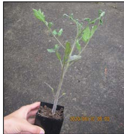
Plants grown in herbicide-contaminated compost may be stunted or may not germinate at all if planted from seed. (see photo credit below)

Finally, you may choose to remove the contaminated soil. It can be spread on lawns or around woody and perennial ornamental plants. If you do this, grass clippings may be contaminated and should not be used for mulch or compost for the vegetable garden. Contaminated soil can also be taken to the landfill. This may be quite expensive.