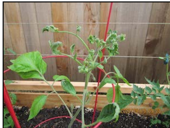
Plant damage from clopyralid or similar herbicides may look like cupping or curling. Not all plants are affected, but many vegetables are. (see photo credit on a page 2)

Depending on soil conditions, clopyralid may last for months to years in soil. Soil microbes like bacteria and fungi help break down these herbicides. The healthier the soil, the faster the herbicide will break down.